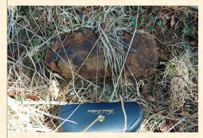
5 inch rocket warhead